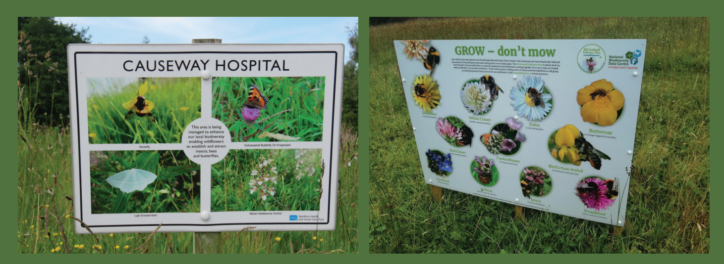
'Low-mow' sign at Causeway Hospital and AIPP 'Grow- don't mow' sign, Manorhamilton.

'Low-mow' strips and mown paths at Causeway Hospital, Co. Derry.